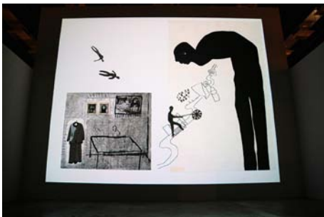
Sadik Kwaish Alfraji The House That My Father Built, 2010 Multimedia Installation (Ansicht Mathaf: Arab Museum of Modern Art, Doha, Qatar, 2010)