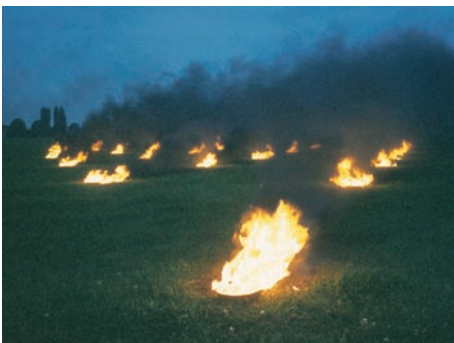
Anthony McCall Landscape for Fire, 1972 16mm Film, 6'55'' (Still) © Anthony McCall Courtesy of Galerie Sprüth Magers Berlin London

Christine Gückel Presse & Kommunikation Wattstraße 10 13355 Berlin Tel: +49 (0)30 443 560 43 Fax: +49 (0)30 201 632 869 christine.gueckel@ikono.org www.ikono.org