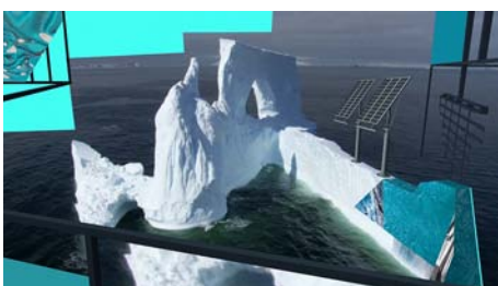
Joe Hamilton Hyper Geography, 2011 Video, 1'00" (Still)