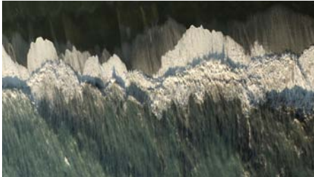
Ange Leccia La Mer, 1991 Videoinstallation, Loop (Still)