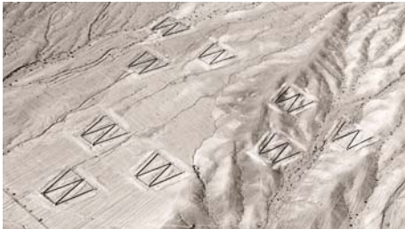
Jananne Al-Ani Shadow Sites II, 2011 Ein Kanal Digital Video, 8'38" (Still)