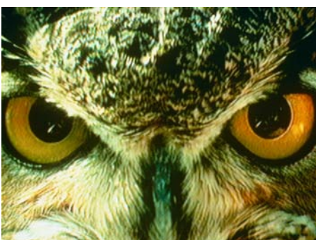
Bill Viola I Do Not Know What It Is I Am Like, 1986 Videotape, Farbe, Stereo Sound; 89 Minuten (Still) © Bill Viola