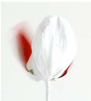
A K Dolven Still Life, 1998 Video Still